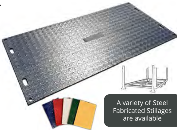
A variety of Steel Fabricated Stillages are available