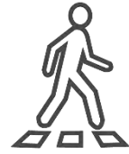
Pedestrian Restricted Areas