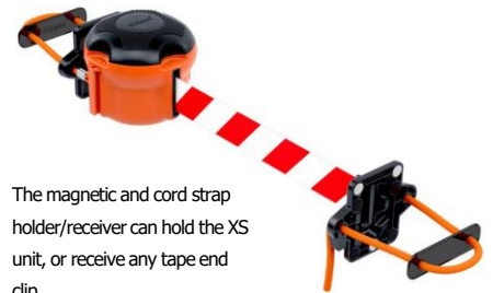
The magnetic and cord strap holder/receiver can hold the XS unit, or receive any tape end clip.